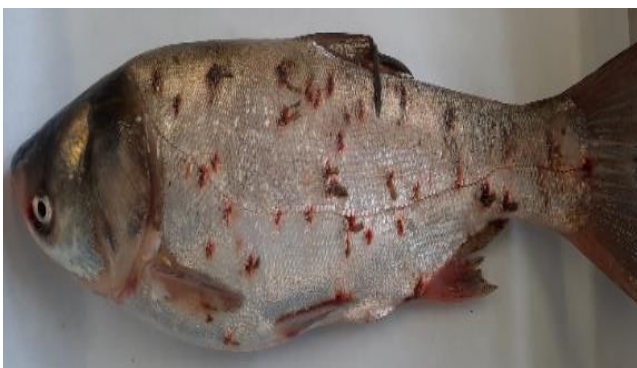
Fig. 1 Silver carp, skin and fins invasion with Lernaea sp.