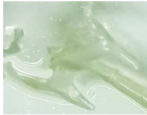
Fig. 4 Lernaea spp. - detail of the anchor-type cephalic formation