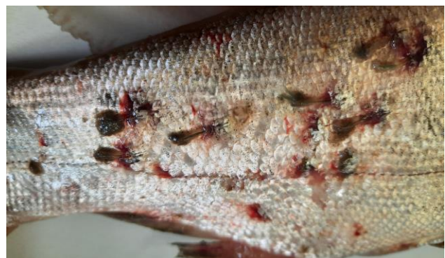
Fig. 2 Detail - crustacean Lernaea sp. attached to the skin