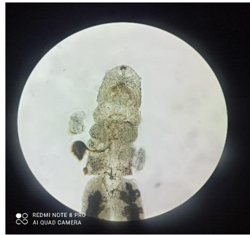
Fig. 6 Sinergasilus sp., magn 100