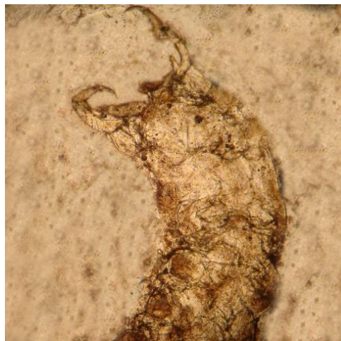
Fig. 7 Sinergasilus spp. - image of cephalic antennae, permanently prepared, magn x 200