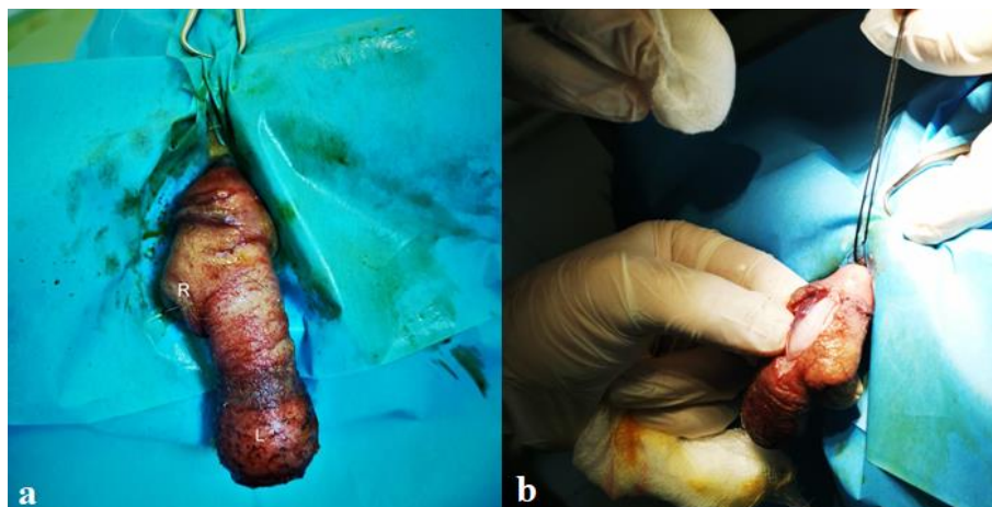
Figure 1. a. The appearance of the prolapsed uterus. The right uterine horn (R) and the left uterine horn (L) b. Longitudinal incision on the protruding mass

Due to traction, the ovaries were located in the mass of prolapsed tissue and not in their physiological position (Figure 3). The ovaries and the uterine horns were then excised vaginally (Figure4).