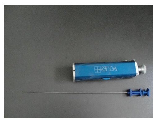
Fig. 1. Automated GTA biopsy gun for ultrasound guided transcutaneous biopsies. Biopsy needle.

Choosing the percutaneous biopsy needles is done according to the patient and biopsy gun (fig. 1). The size may vary (14G, 16G, 18G, 20G with lengths of 6, 9, 15 cm) from case to case (fig. 2).