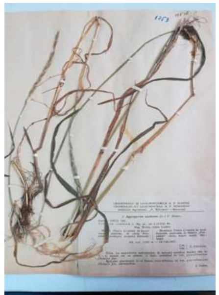
Figure 2. Elymus caninus

Elymus caninus (syn. Agropyron caninus ) has a native Euro-Asiatic areal, but narrower than the previous species. On the West side, its areal starts from Iceland and Great Britain from where it rapidly advances towards East countries up to South Siberia. The South limit ends in the North of the Mediterranean Sea from where it grows up to subarctic regions (Yan C., Sun G., 2012). In Romania it habituates on forests, forest clearings, shrubberies, debris, grass cliffs and more frequently in the mountain level. It is a plant without long stools and with aristate glumes that can reach 10 mm in length ( figure 2 ).