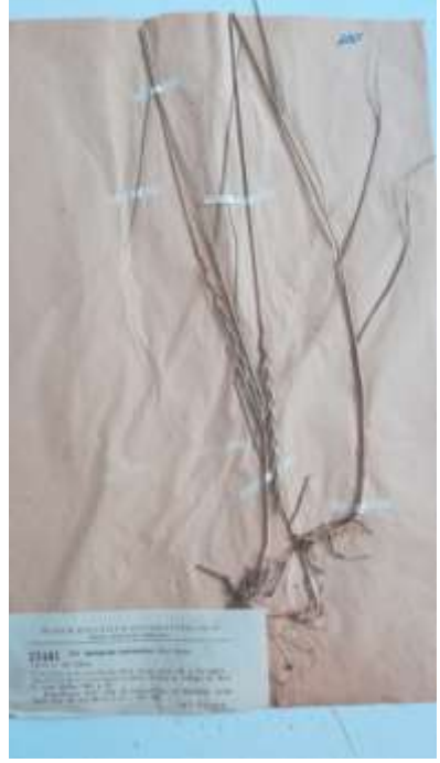
Figure 1. Elymus hispidus

Elymus hispidus (syn. Agropyron intermedium ) grows in central and southern parts from Europe from where it extends towards Central Asia (Mizianty M., Szczepaniak M., 1997). It is morphologically similar to E. repens in that it develops long and creeping rhizomes, but unlike it, its lemma is entirely glabrous ( figure 1 ).