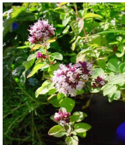
Figure 1 Origanum vulgare

It is an herbaceous, perennial, erect, branched at the top species, being 30-60 cm high (80 cm), with aromatic odour. It is a horizontal gray-brown.