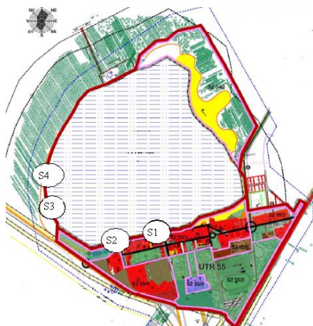
Fig 1 Area study

The present study on algal taxa was conducted in May 2013 four different stations (S1, S2, S3 and S4). The first two stations are located near Salt Lake resort balneoclimatică (S1, S2), and the next two are located around the central area sources (S3, S4) (figure 1).