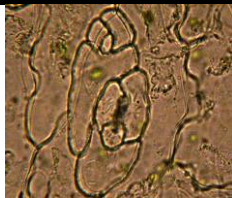
Fig. 1. ARIAL 9 XXXXXXXXXXXXXXXXXXXXXXX