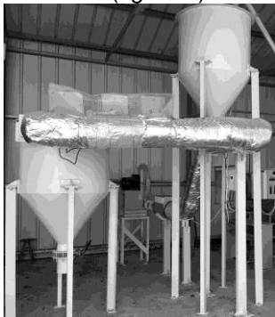
Figure 1 The innovative equipment hybrid drying

seeds of the hybrid DKC 5068. The drying was carried out in the innovative equipment hybrid drying with a drying capacity of 500 kg/h and an installed power of microwaves of 2400 W at a frequency of 2.45 Ghz (figure 1).