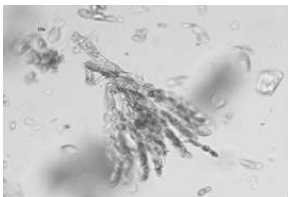
Figure 1 Monilinia fructigena - conidia chains (Florina variety)

The microscopic identification of the fungus revealed the formation of yellowish, unicellular conidia arranged in branched chains (figure 1, 2).