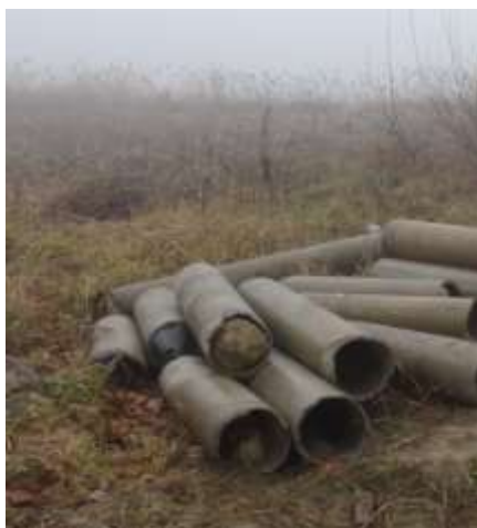
Figure 4 The state of replaced asbestos irrigation pipes (Luca M., 2016)

- canal overcrossing pipes are worn out, corroded, show displacements from the original position; anchorage blocks made of simple concrete are structurally degraded, settled, and do not ensure anymore that the pipes are properly supported ( figure 5 );