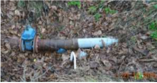
Figure 6 State of SPPM connections to tertiary irrigation pipe

The rehabilitation of the irrigation plot aims at increasing the water use efficiency, which at the present stage is much smaller than that ensured at the design stage. Decrease in efficiency is due to water losses from the aging and degraded pipeline network. Also, the rehabilitation aims to improve the watering performance in the field using modern aspersion watering equipments, which have a high productivity and high reliability in service.