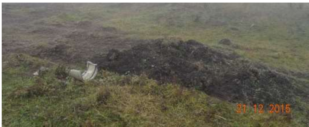
Figure 3 Detail on the state of pipe sections made of asbestos tubes (damage to joints, tube breaks) (Luca M., 2016)