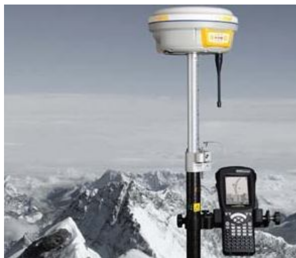
Figure 4 GPS SOUTH S82T system receiver

Measurements were performed with GPS SOUTH S82T (Figure 4), whose field book has implemented software transcomputation real-time geographic coordinates obtained in STEREO-70 co-ordinate system.