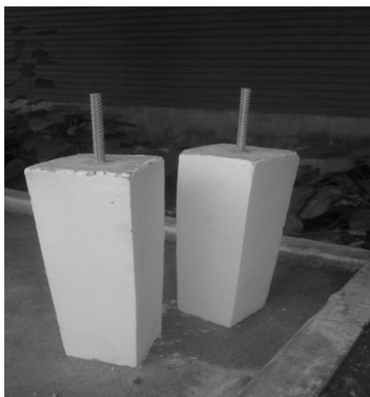
Figure 2 Landmark preparation