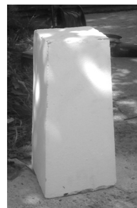
Figure 3 Landmark's placing in the Faculty's courtyard