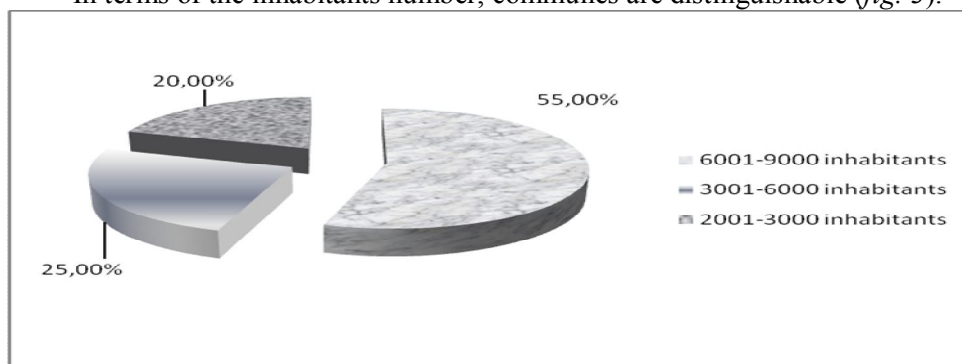
Figure 3 Structure of commune dimension on the number of inhabitants

In terms of the inhabitants number, communes are distinguishable ( fig. 3 ).