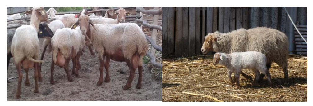
Figure 2. The development of the mammary gland in Rovasi breed and ewes with lambs at 30 days postpartum

For batch L1, consisting only of Tigaie breed females, the estimated milk quantity for the first 30 days of nursing was 26.98±0.82 kg, which was lower than the values reported by Radu et al., 2010, who indicated an average production of 30.45 kg of milk for the same time interval. For the 30-60 days nursing period, it is observed that the mean values obtained between the two groups were 32.48±0.18 kg for L1 and 38.20±0.88 kg for the L2 group. The statistical analysis showed a significant difference in the average milk production between the two groups, favoring the group composed of females belonging to the new type. The difference between the groups was 5.72 kg, which was significant at P < 0.01.