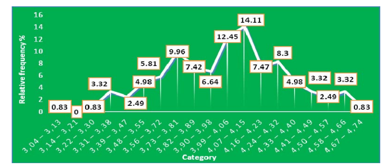
Fig. 4 The range of variation for the fat content, at the first normal lactation, for the Brown breed from the Suceava country