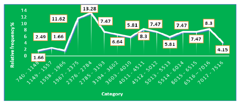
Fig. 2. The range of variation for the quantity of milk, at the first normal lactation, for the Brown breed from the Suceava country

The analysis of milk production on successive lactations highlights the fact that also in the Brown breed bulls from the area of Suceava county there is a good productive precocity, given the fact that in the first