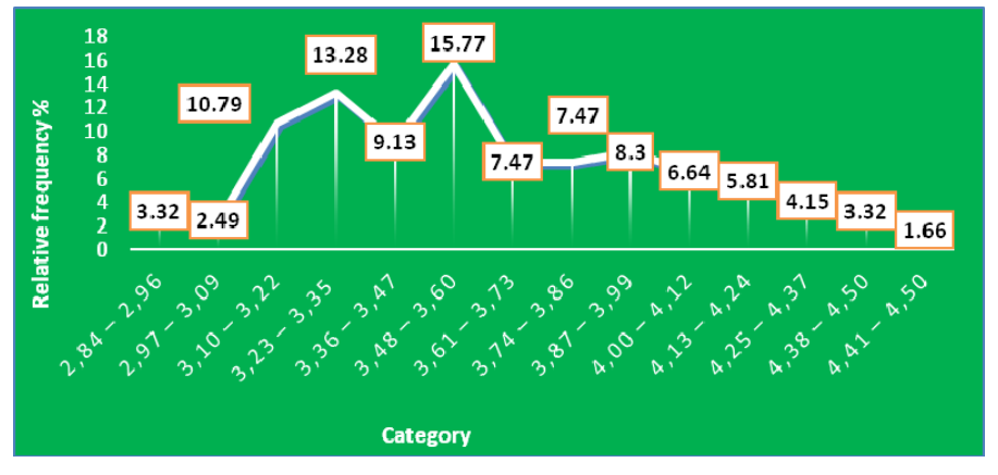
Fig. 5. The range of variation for the protein content, at the first normal lactation, for the Brown breed from the Suceava country