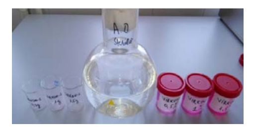
Fig. 1 Preparation of Virkon'S solutions a) weighing the powder; b) preparing the solution

In the first phase, it was checked whether the area on which the research is to be carried out is free from germs; this involved the collection of sanitation tests and the analysis of the results.