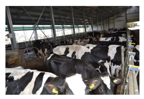
Fig. 1 Housing system in experimental group cows

The study was conducted within a dairy cattle farm cattle farm, form North Eastern of Romania, on an experimental group (Group E) consisting of 43 cows (Romanian Black Spotted Breed), compared to a control group (group C), consisting of 50 cows (Romanian Black Spotted Breed). Cows were maintained in loose housing system in shelters with a capacity of 200 animals (Fig. 1).