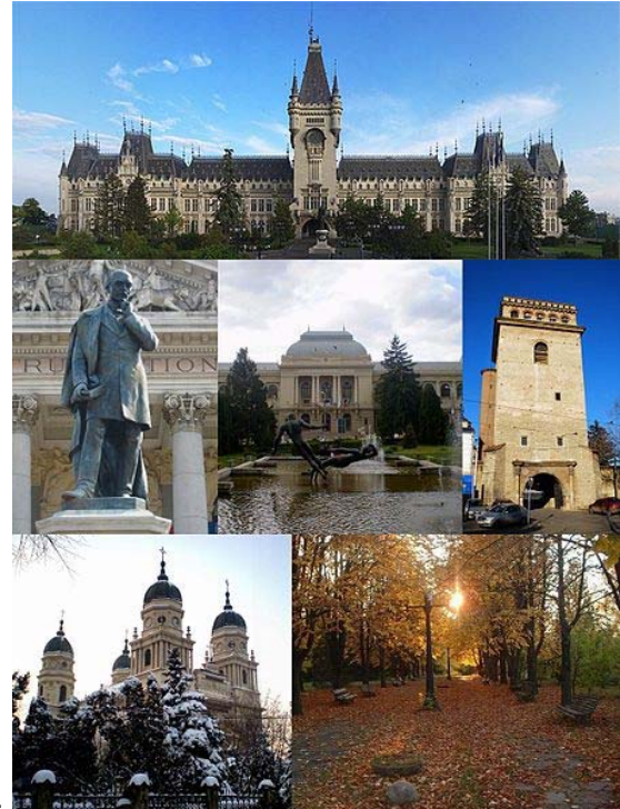
From top left: Palace of Culture, Vasile Alecsandri Statue in front of the National Theatre, Alexandru Ioan Cuza University, Golia Tower, Metropolitan Cathedral, and the Botanical Garden