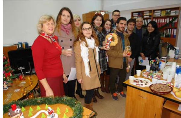
ESN and incoming students Christmas days in USAMV Iasi